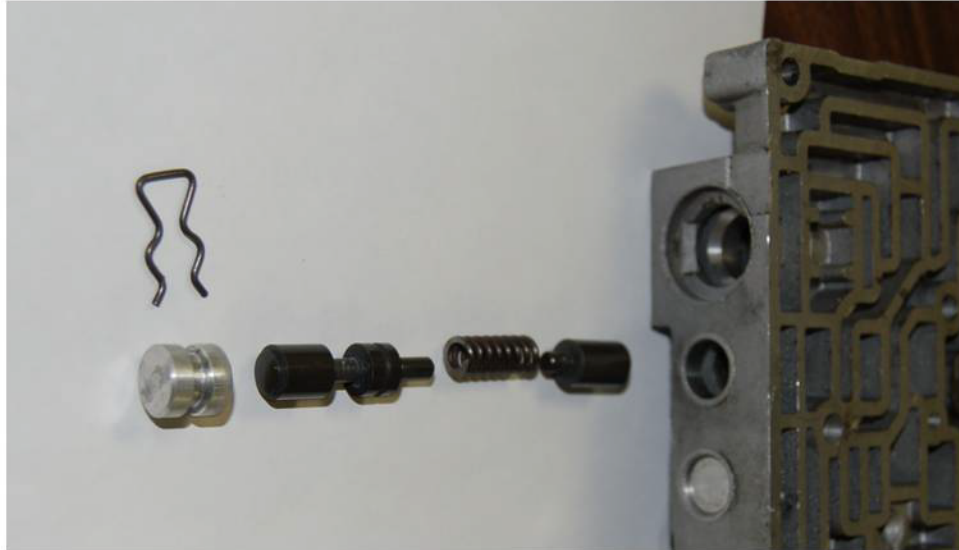
OEM TCC Components